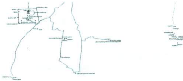
Fig.No. 3 Map of Nalanda Ruins and its vicinity Fig. No.4 Map of Rajgir and its vicinity

Through extensive excavations in the surrounding area of the ancient Nalanda Mahavihara more Stūpas may be discovered which will not only enrich the Buddhist history but also attract the entire Buddhist world.